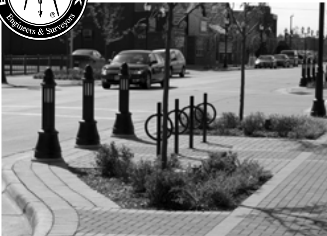
2011 Project of the Year City Engineers Association of Minnesota (CEAM) Central Avenue Reconstruction, Osseo, MN — $4,000,000 Project